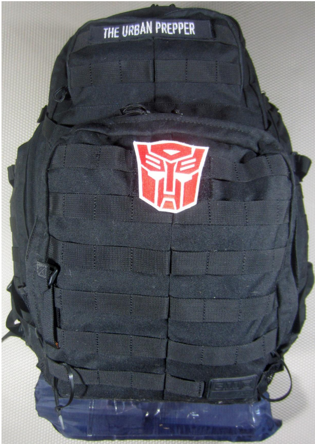
Urban Bug Out Bag